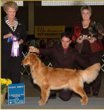
"Journey" wins at the Ft.Worth Specialty!