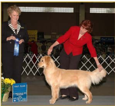
"Arielle" wins her class at the Specialty!