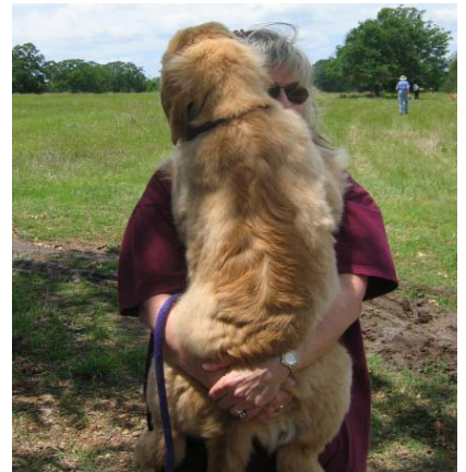
Why walk when you can be carried!

People, Puppies, Ponds, and a Whole Lot of Fun! Sprig Fun Day Photos Inside!