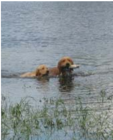
"Mack" (Gower) schooling a puppy!