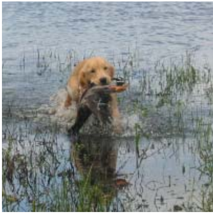
Look at what I found!

Note: All ideas and ads are published at the Editor's and Board of Directors' discretion. Opinions expressed may not reflect the opinion of the Editor and/or Members of the Austin Golden Retriever Club.