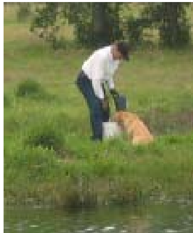
Forget the bird, I found the bucket!